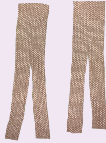
Elastic zinc oxide tape