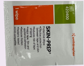
Skin protective preparation wipe

*Refer to your local facility for tape type preferences